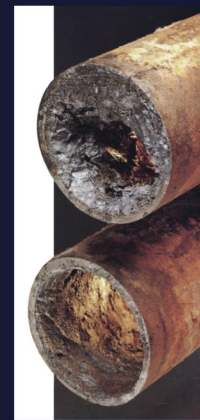
Cut-outs of pipe with waste deposits before and after BioClean treatment.